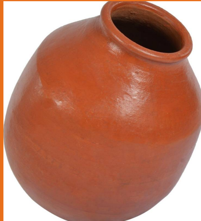
GHATAM CLAY POT